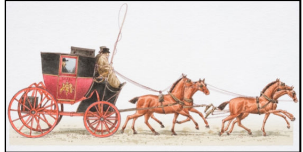
A horse and carriage for a rich family

Going to the seaside used to be something that only rich people could do. They could travel in their expensive carriage and spend a few weeks or even a few months by the sea. Poorer people couldn't do this as they couldn't afford the trip or take the time away from their work as travelling by carriage took a long time.